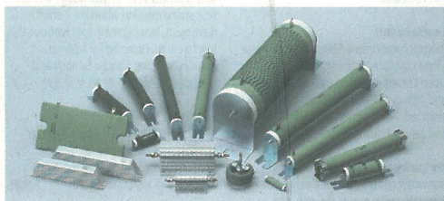
A selection of Tamaohm resistors

The wide range of exhibits at electronicAsia also includes cables, general semiconductors, microwave technology, and manufacturing equipment and logistics for microsystems technology.