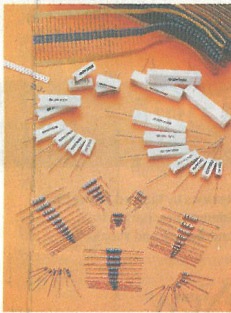
Resistors produced by Hong Kong Resistors Manufactory International

Fong Kong Resistors Manufactory International has been making resistors on the mainland for 28 years, and has participated in electronicAsia for several years. "The reason why we keep having the booth is